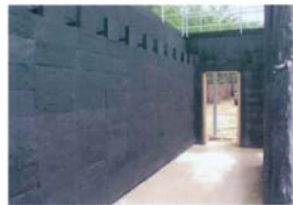
Military Training Shoot Hall